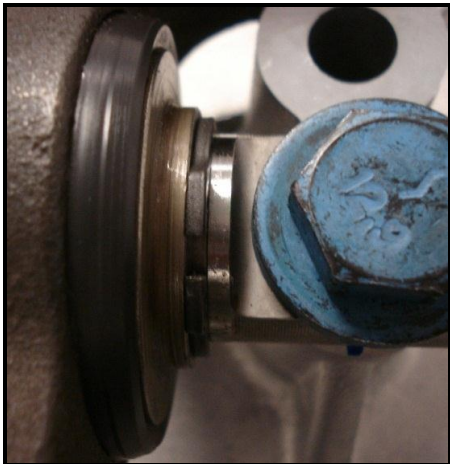
Previous spacer design

Corrective Action: A new side spacer, with an increased shoulder diameter for improved seal retention, was implemented in production 09/18/2014. The service part number A-7786 will not change.